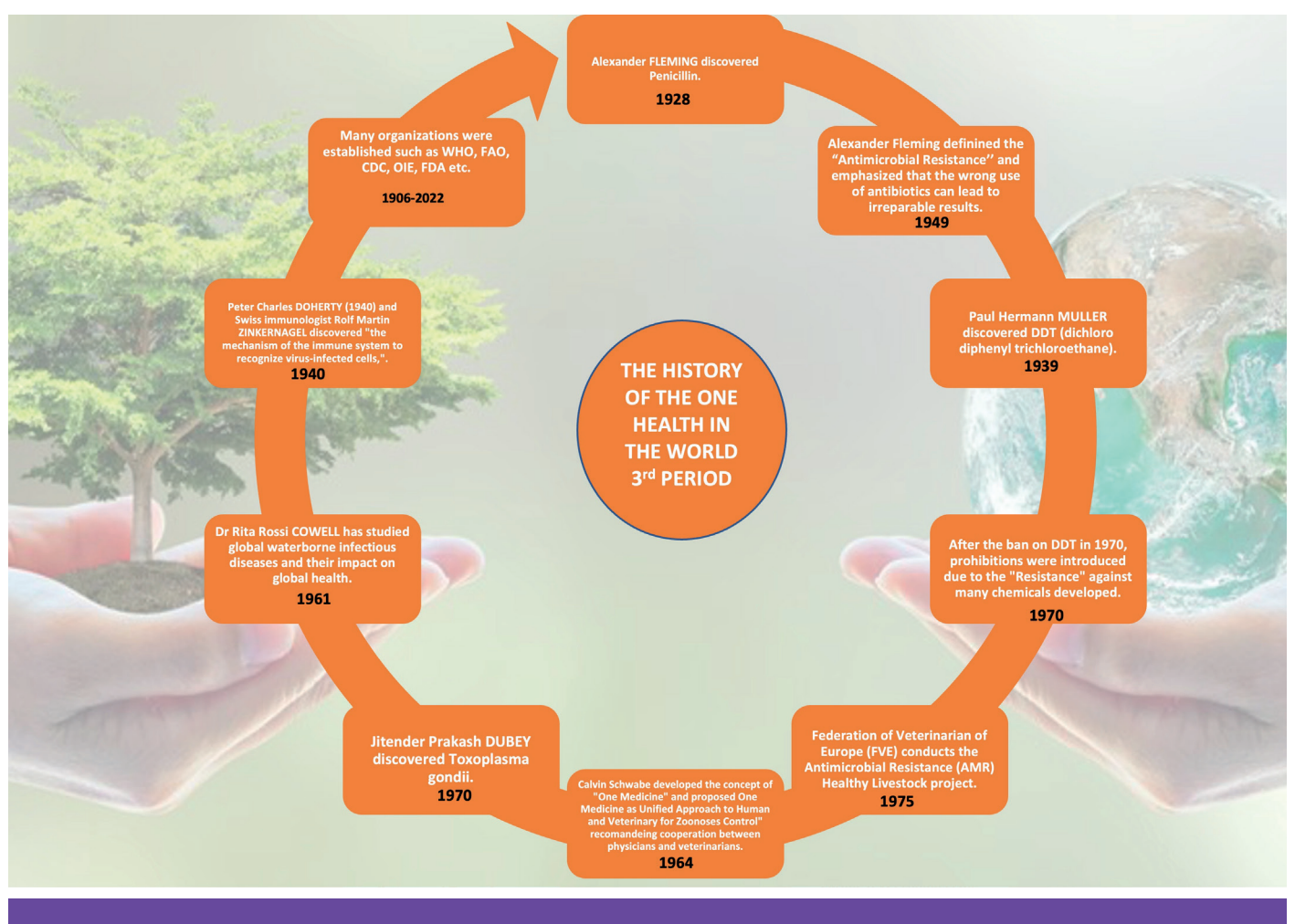
Figure 3. The history of the One Health in the world 3<sup>rd</sup> period

a new era has begun. In 1994, the concept of "Globalization" was developed and applied in almost every field (eg "Global Economy", and "Global Trade"). In this context, WHO has also developed the concept of "Global Health". However, this approach left its place in the "One Health" concept in the early 2000s. Soon after, in 2002, WHO developed the slogan "One World One Health". The World Organization for Animal Health (OIE) also defined in 2020 the concept of "One Health" as "Ecosystem Health" (47).