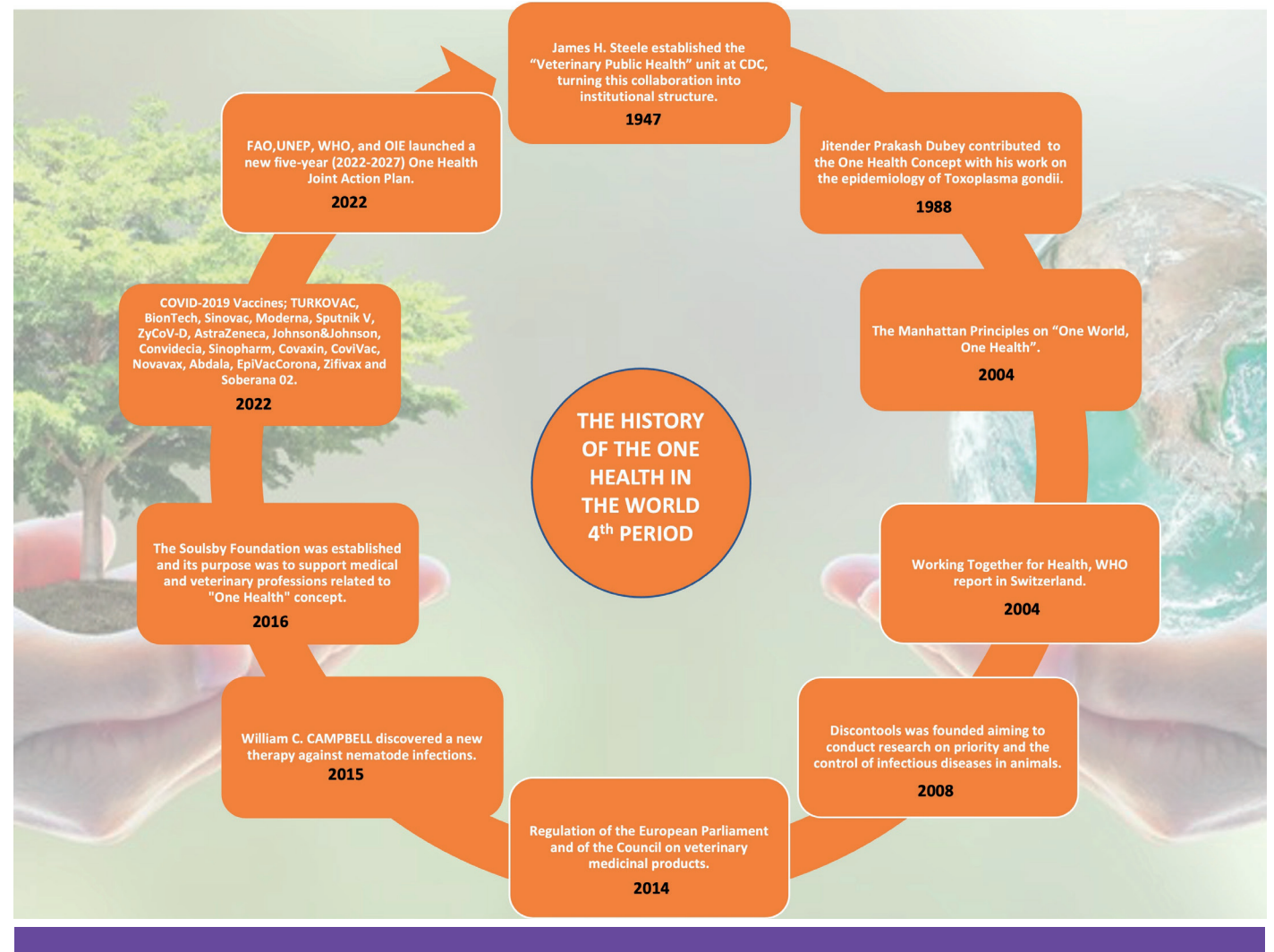
Figure 4. The history of the One Health in the world 4<sup>th</sup> period

this concept should be given as a "Compulsory Lesson" and "Course Information Packages" in the "National Core Curriculum" of faculties Veterinary, Medical, Dentistry, Pharmacy and Health Science. In addition, the UNESCO Eco Health/Environmental Health initiative supported the protection of the sea and oceans and the creation of the necessary culture for this with the slogan "One Earth-One Ocean (OEOO) (49). In Turkey, "Veterinary Public Health Departments" were established in Veterinary Medicine Faculties within the scope of the Council of Higher Education, UNESCO/ISCED Education Standard Classification. This development meets an important need and is very beneficial in creating an academic infrastructure for rapidly acquiring the "One Health" culture in higher education. The next step in developing the "One Health" approach, as seen in the United States and Europe, is to integrate "One Health" into the curricula of relevant higher education units. Today, in accordance with the "One Health" concept, the epidemiology of zoonotic infections is mainly evaluated together with their ecological factors and dynamics of the causative pathogens with enzootic characteristics. In this context, it is necessary to examine the ecology of T. gondii , which causes toxoplasmosis, one of the most common parasitic infectious diseases in the world.