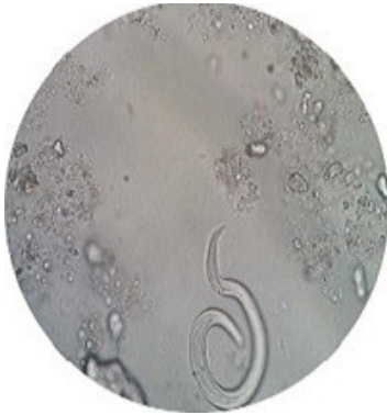
Figure 1. Appearance of Baermann-Wetzel sediment in cat of A. abstrusus first stage larvae (L1)

Two of these five 5 cats were female and they lived in a different home environment from each other, but they were communicating with the outside environment. Two of the 5 cats had clinical symptoms such as pulmonary wheezing, coughing and respiratory distress, but these clinical symptoms were not observed in 3 of them. Considering the history of the 5 positive cats and the 2 owner cats included in this group, it was learned that they did not apply antiparasitic treatment. Radiographic images (Figure 2) were obtained from 2 of the cats in which larvae were detected in their stools. While detected a mild bronchiole pattern in one of